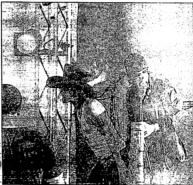
Tyler gives a dynamic show while the camera rolls.